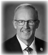
GREG SANKEY Commissioner